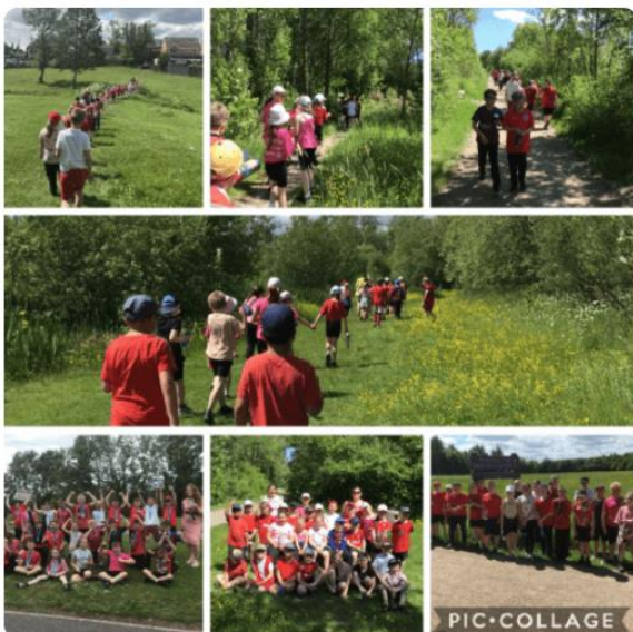
Race for Life